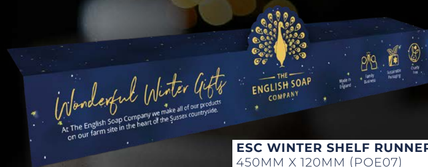
ESC WINTER SHELF RUNNER 450MM X 120MM (POE07)