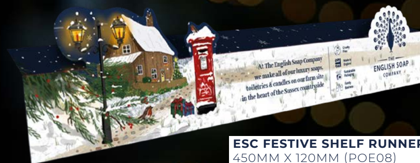
ESC FESTIVE SHELF RUNNER 450MM X 120MM (POE08)

Complementing our year round Point of Sale, are beautiful festive shelf runners enhance any display. Available to add to any order, free of charge. We have a digital Point of Sale Brochure with further details. Please contact us if you would like to be sent a copy.