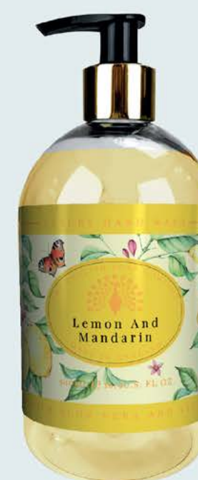
LL0012 Lemon & Mandarin