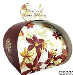
GS0004 Clematis & Lime Blossom