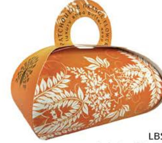
LBS0003 Patchouli & Orange Flower