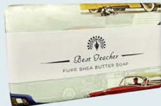
OS0002 Best Teacher (Sandalwood)