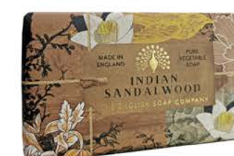
SS0015 Indian Sandalwood