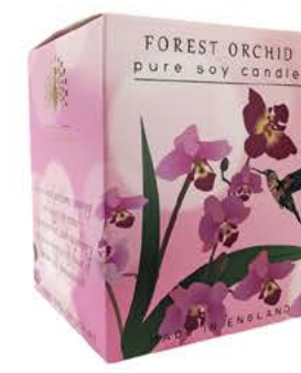
LMC0013 Forest Orchid