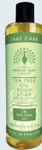
AS0008 Tea Tree Body Soap