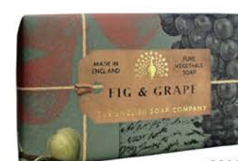
SS0006 Fig & Grape