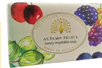
CHI0011 Autumn Fruits