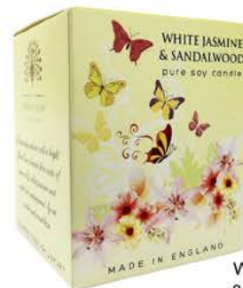
LMC0005 White Jasmine & Sandalwood