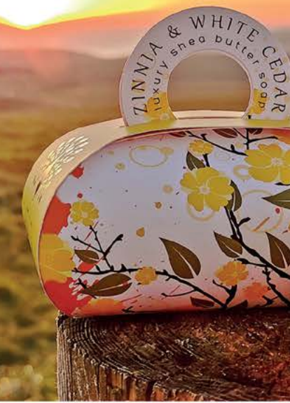
LBS0001 Zinnia & White Cedar

• Small guest bag soap 3 x 20g. No. in case: 14