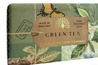
SS0004 Green Tea