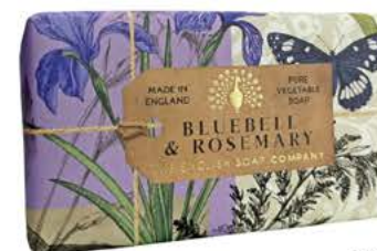
SS0001 Bluebell & Rosemary