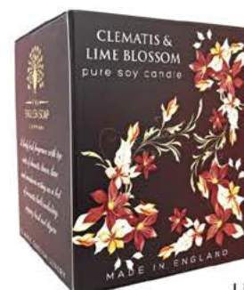
LMC0004 Clematis & Lime Blossom