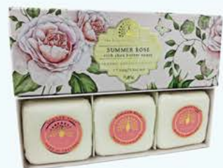
SBE0008 Summer Rose