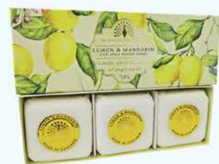
SBE0012 Lemon & Mandarin