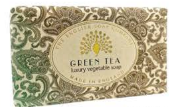
CHI0004 Green tea