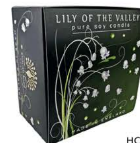
HC0002 Lily Of The Valley