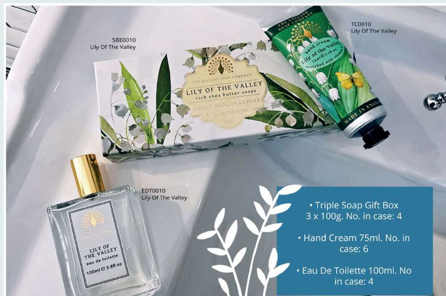
SBE0010 Lily Of The Valley