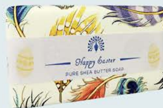
OS0011 Happy Easter (Bluebell)

This shea butter soap collection includes a wonderful mix of patterned wraps, from elegant, to vintage, romantic to floral. With a variety of fragrances to choose from, these soap bars also feature a special message, perfect for that special occasion or moment.