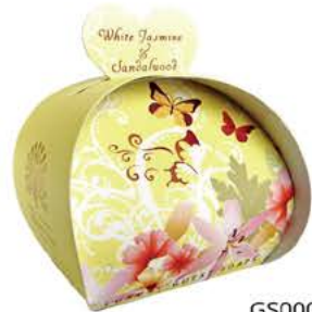
GS0005 White Jasmine & Sandalwood