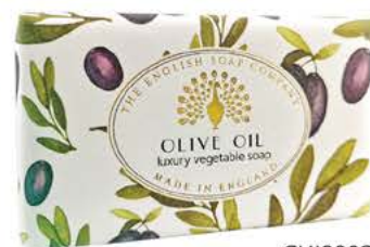
CHI0003 Olive Oil