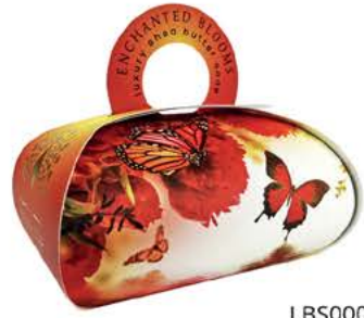
LBS0009 Enchanted Blooms