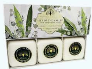
SBE0010 Lily Of The Valley