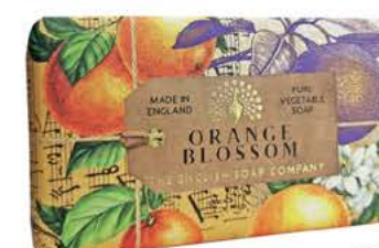
SS0014 Orange Blossom