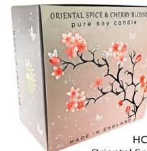
HC0001 Oriental Spice & Cherry Blossom