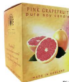
LMC0015 Pink Grapefruit