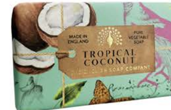
SS0020 Tropical Coconut