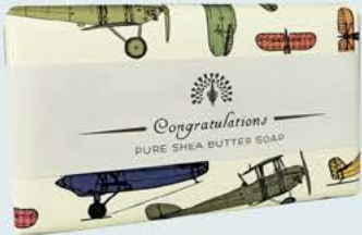
OS0007 Congratulations (Sandalwood)