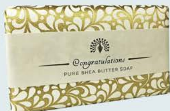
OS0008 Congratulations (Lemon)