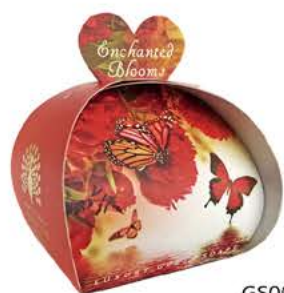
GS0011 Enchanted Blooms