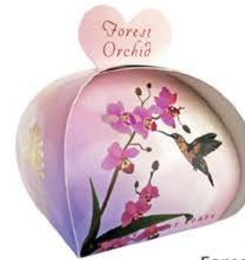
GS0013 Forest Orchid