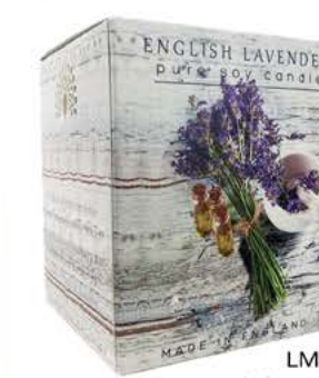
LMC0009 English Lavender

Our pocket-sized luxury guest soaps make a perfect little gift for a house guest, a wedding favour, when travelling, or simply as a token for a loved one.