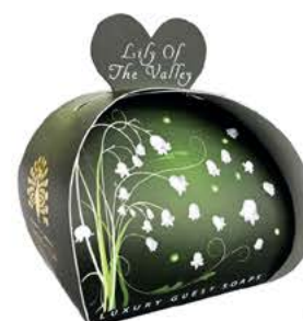
GS0012 Lily Of The Valley