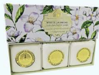
SBE0005 White Jasmine