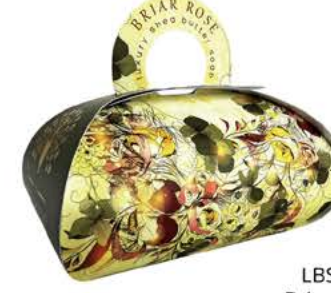
LBS0002 Briar Rose