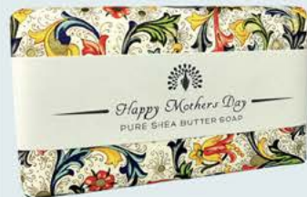
OS0005 Happy Mothers Day (Honey)