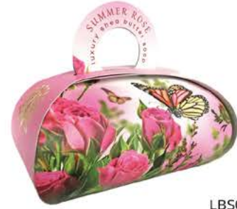
LBS0008 Summer Rose