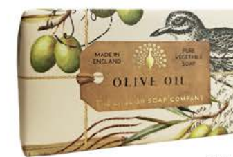
SS0003 Olive Oil