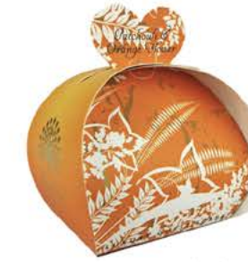
GS0003 Patchouli & Orange Flower