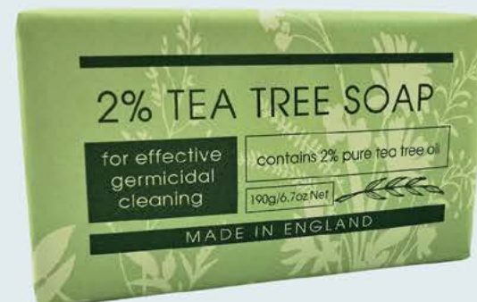
AS0002 Tea Tree Soap

Keep on top of sanitisation with our handy 100ml sanitiser spray and long-lasting 500ml gel.