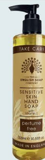
AS0020 Sensitive Skin Hand Soap