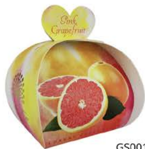
GS0015 Pink Grapefruit