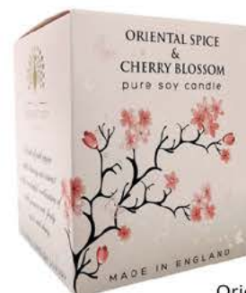
LMC0006 Oriental Spice & Cherry Blossom