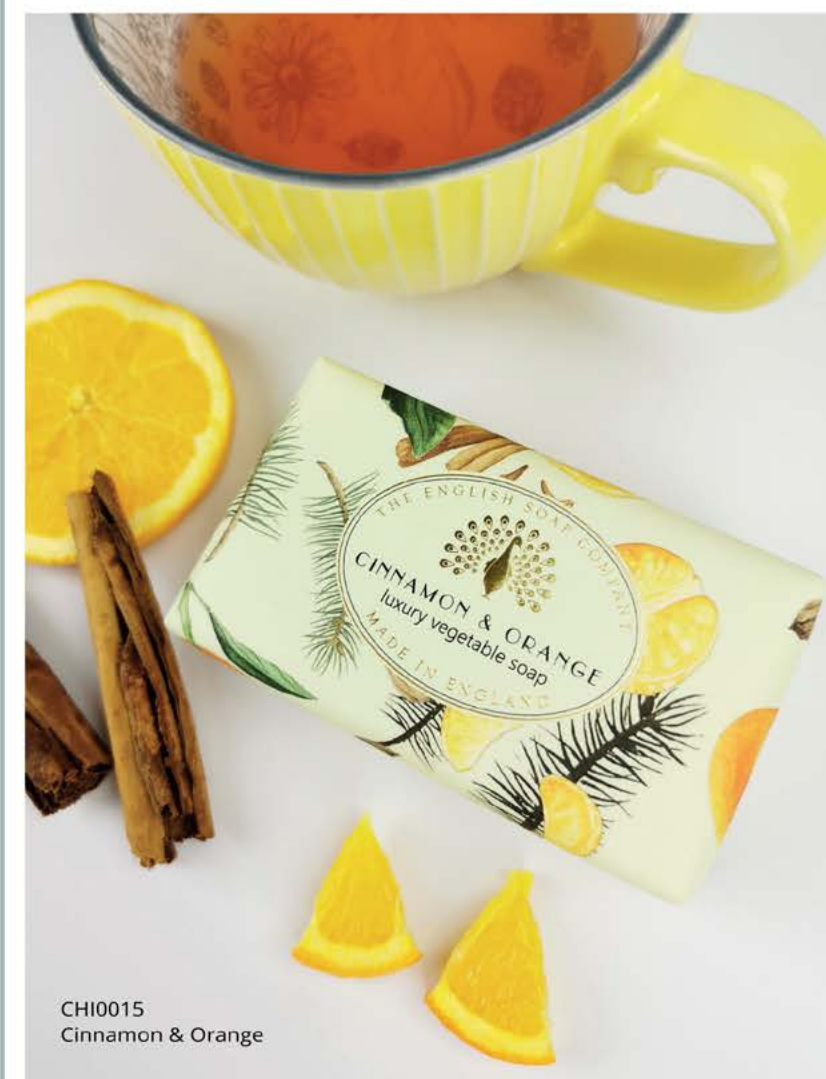
CHI0015 Cinnamon & Orange

Beautifully wrapped in vintage style papers, these soaps are available in a wide range of fragrances from fruity to floral, to warm and exotic. Enriched with shea butter, these vegan friendly soaps are suitable for all skin types.