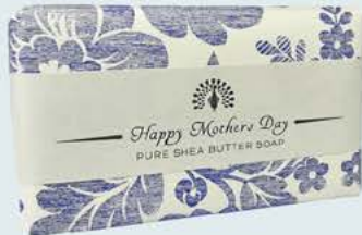
OS0006 Happy Mothers Day (Bluebell)