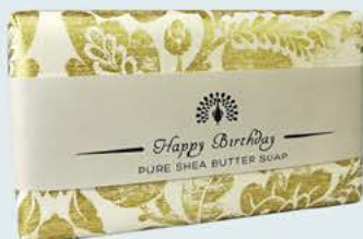
OS0009 Happy Birthday (Lavender)