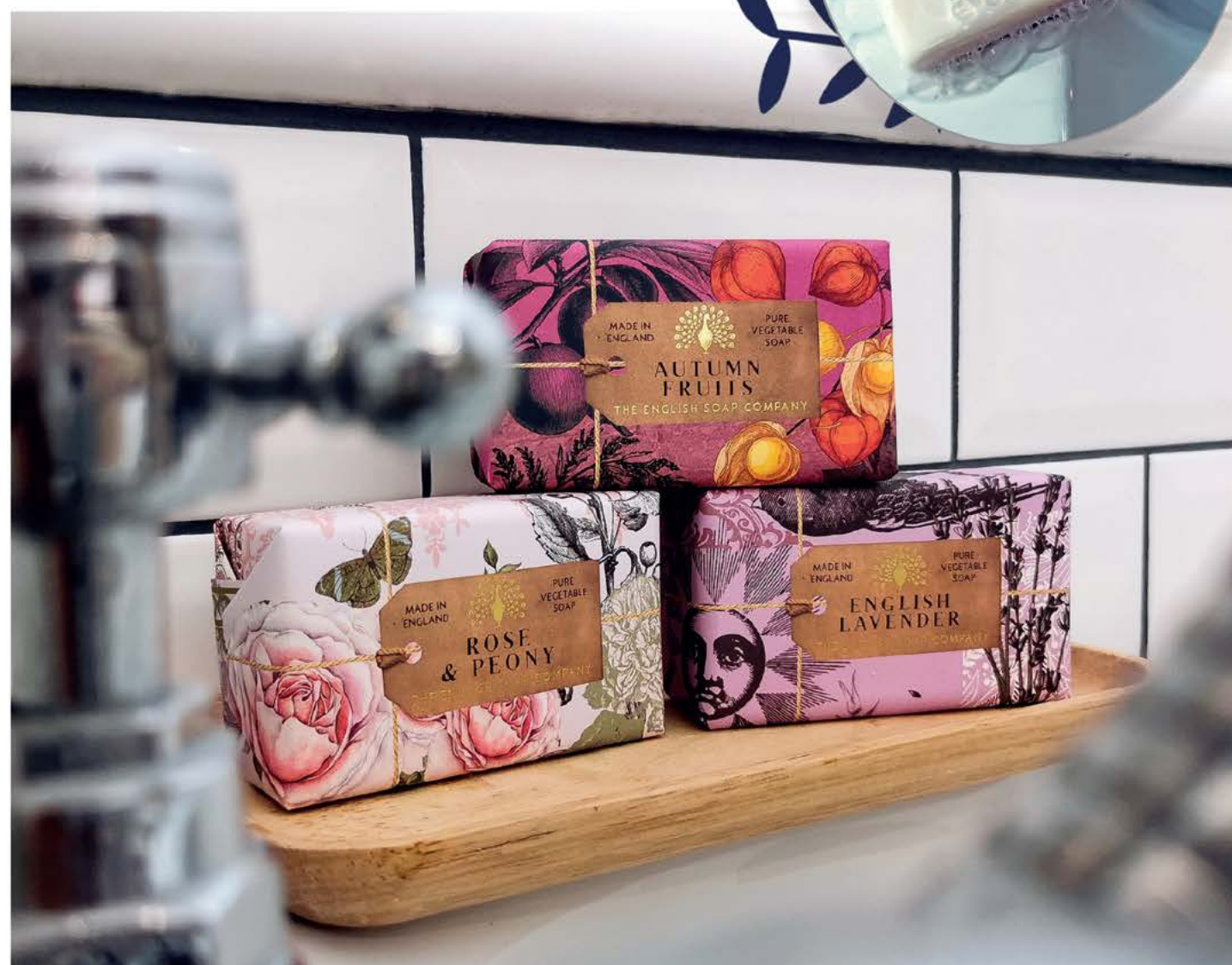
SS0007 English Lavender