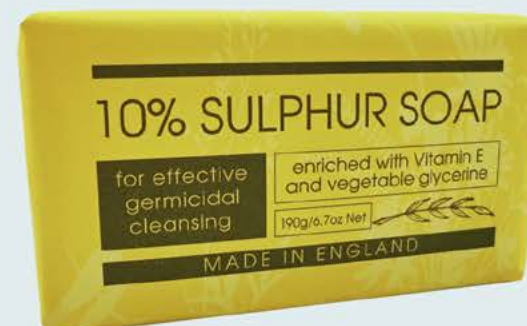
AS0001 Sulphur Soap