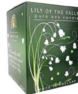
LMC0012 Lily Of The Valley