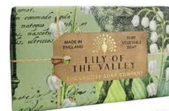
SS0013 Lily Of The Valley