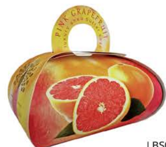
LBS0015 Pink Grapefruit