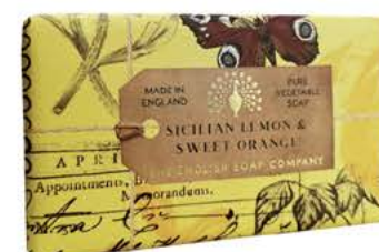
SS0008 Sicilian Lemon & Sweet Orange