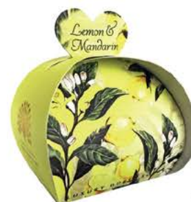
GS0014 Lemon & Mandarin