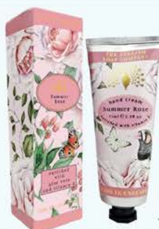
TC0008 Summer Rose