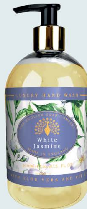
LL0005 White Jasmine