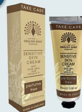
AS0011 Sensitive Skin Cream