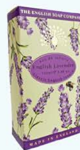
EDT0007 English Lavender