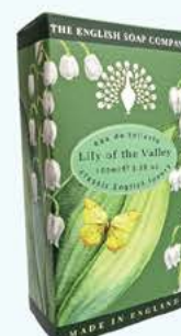
EDT0010 Lily Of The Valley