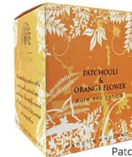
LMC0003 Patchouli & Orange Flower