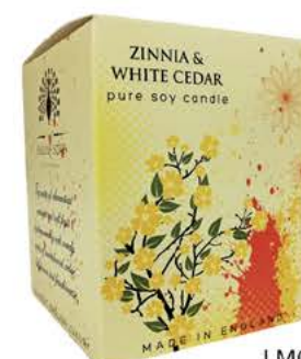
LMC0001 Zinnia & White Cedar

• Large gift bag soap: 260g No. in case: 6