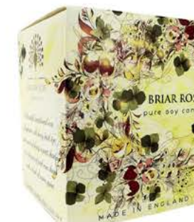
LMC0002 Briar Rose