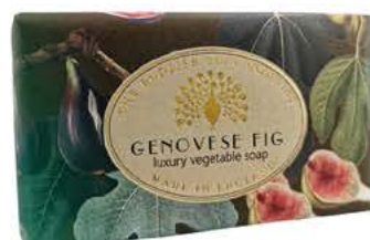
CHI0006 Genovese Fig