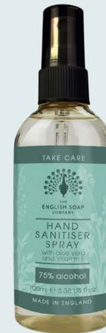
AS0018 Hand Sanitiser Spray