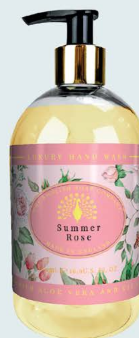
LL0008 Summer Rose