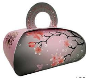
LBS0006 Oriental Spice & Cherry Blossom