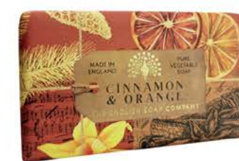
SS0012 Cinnamon & Orange