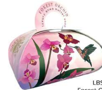
LBS0011 Forest Orchid