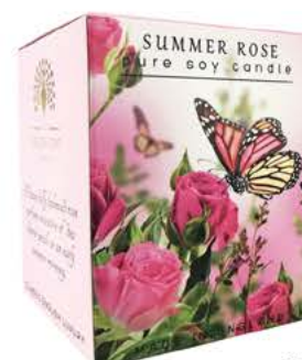
LMC0010 Summer Rose