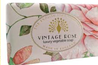
CHI0009 Vintage Rose