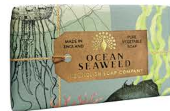
SS0016 Ocean Seaweed