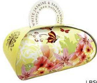
LBS0005 White Jasmine & Sandalwood