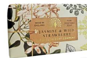
SS0002 Jasmine & Wild Strawberry