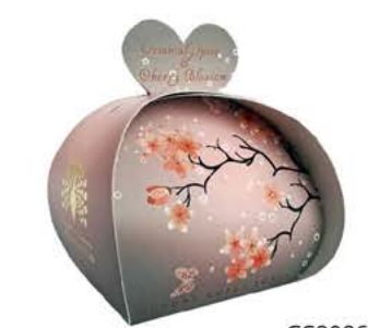
GS0006 Oriental Spice & Cherry Blossom