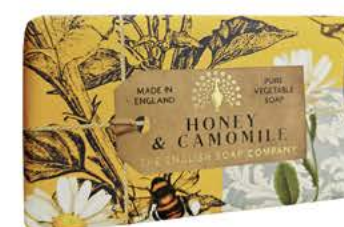
SS0010 Honey & Camomile