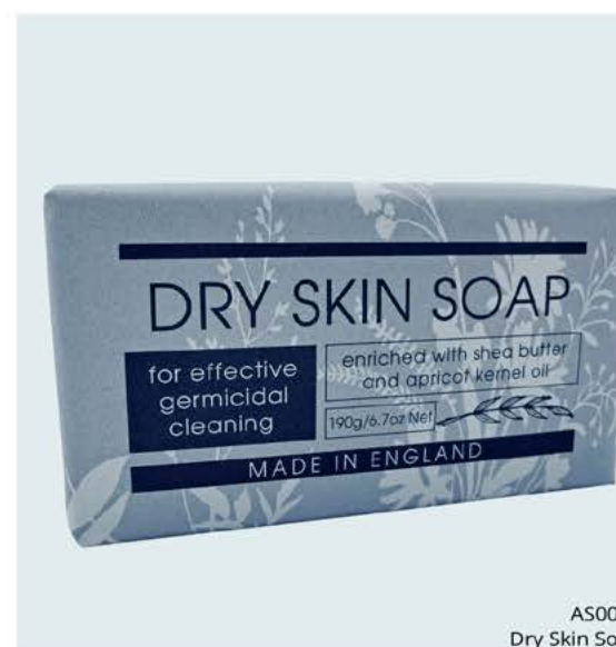
AS0005 Dry Skin Soap