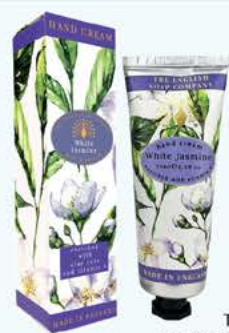
TC0005 White Jasmine