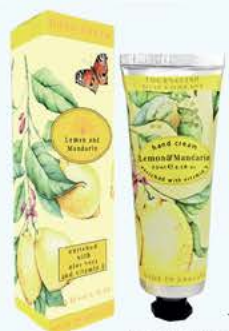
TC0012 Lemon & Mandarin