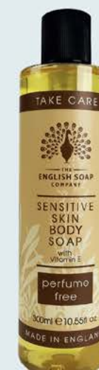
AS0012 Sensitive Skin Body Soap