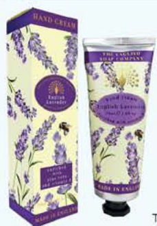
TC0007 English Lavender