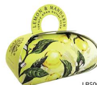
LBS0012 Lemon & Mandarin