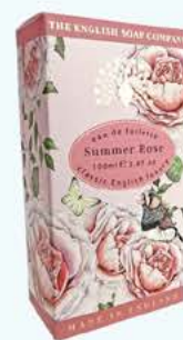
EDT0008 Summer Rose