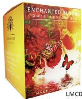
LMC0011 Enchanted Blooms