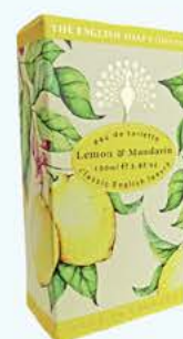
EDT0012 Lemon & Mandarin