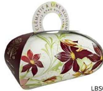
LBS0004 Clematis & Lime Blossom