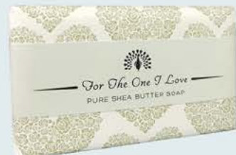
OS0004 For The One I Love (Rose)