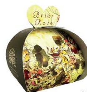
GS0002 Briar Rose