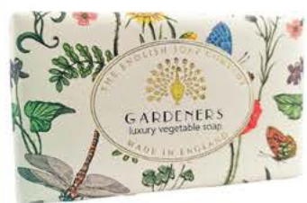
CHI0005 Exfoliating Gardeners