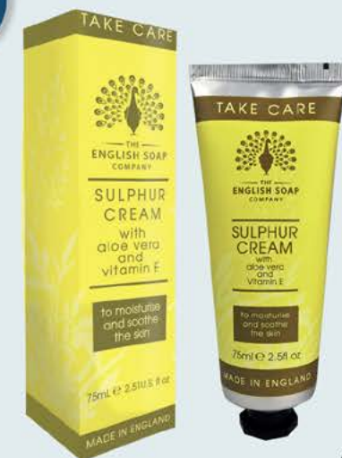
AS0006 Sulphur Cream