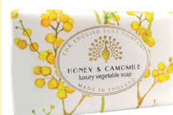
CHI0010 Honey & Camomile