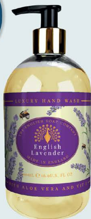
LL0007 English Lavender