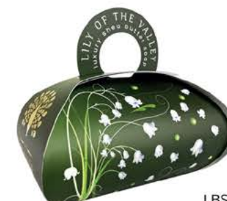
LBS0010 Lily Of The Valley