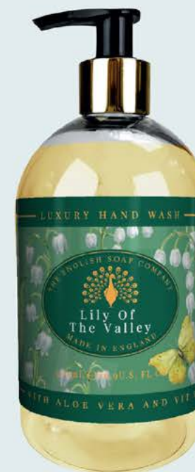
LL0010 Lily Of The Valley