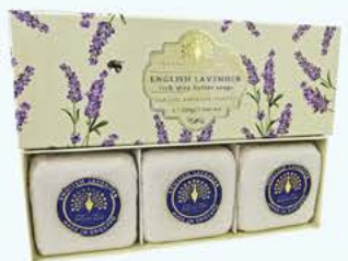
SBE0007 English Lavender