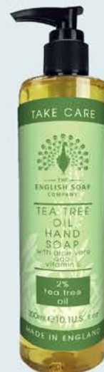
AS0007 Tea Tree Hand Soap