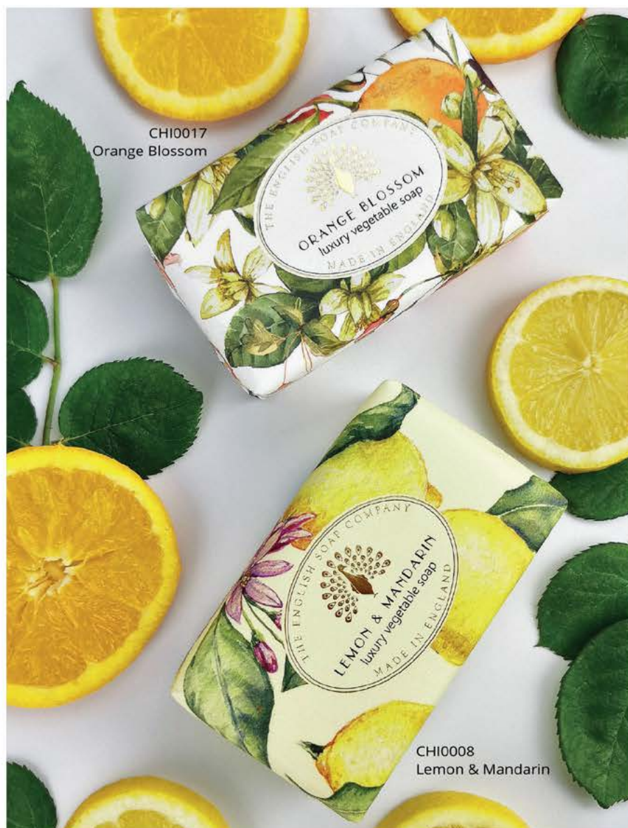
CHI0017 Orange Blossom