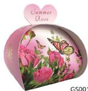
GS0010 Summer Rose