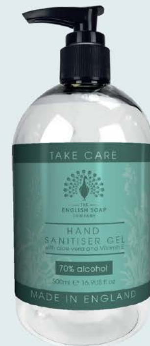
AS0022 Hand Sanitiser Gel