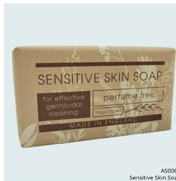
AS0004 Sensitive Skin Soap