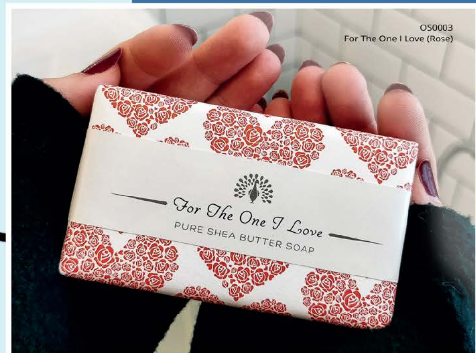
OS0003 For The One I Love (Rose)