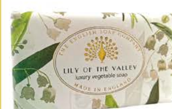
CHI0016 Lily Of The Valley