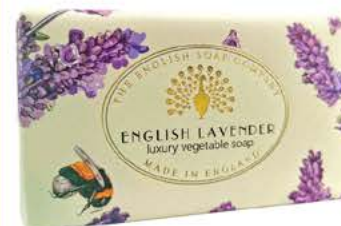
CHI0007 English Lavender