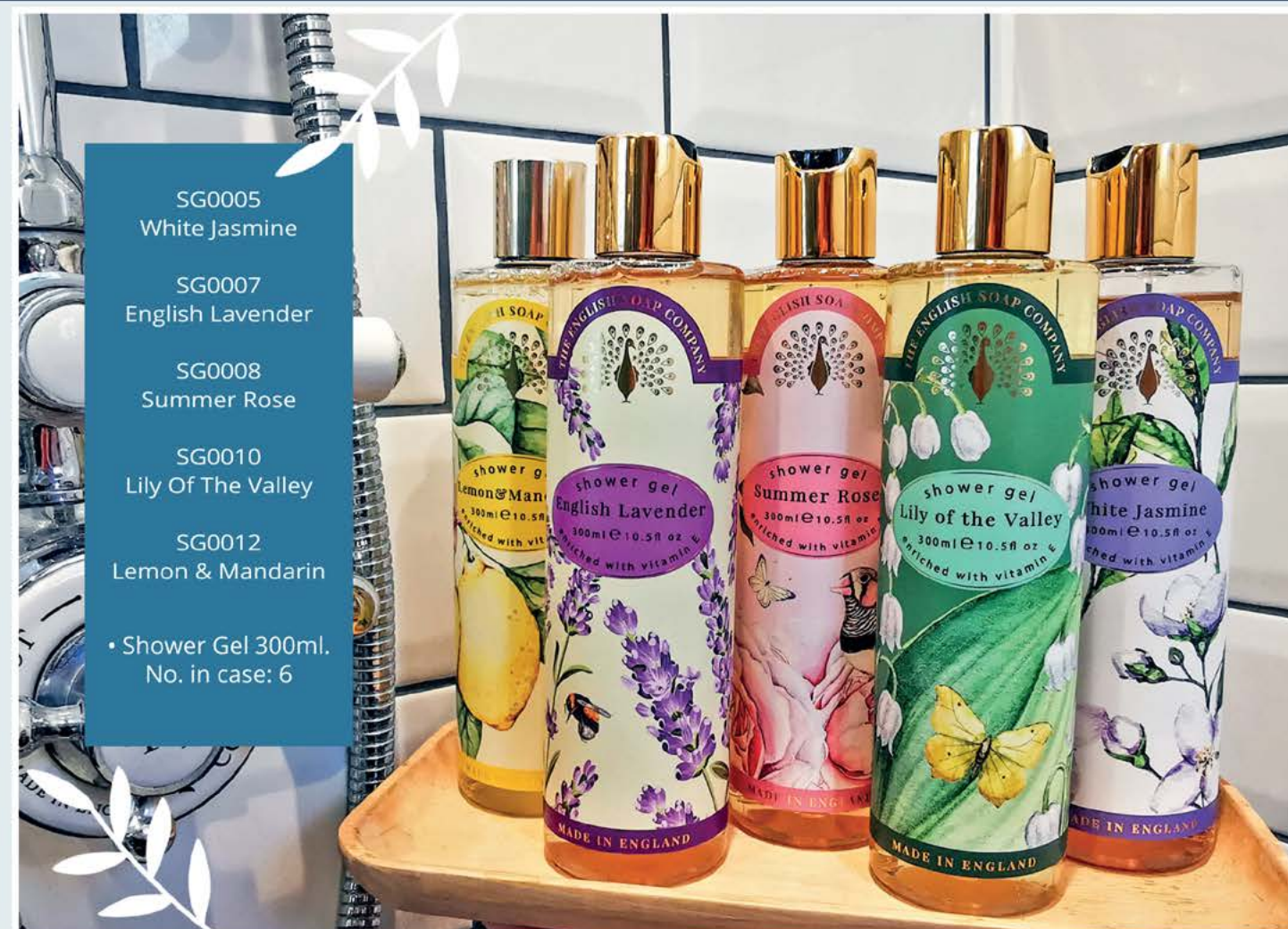
SG0005 White Jasmine