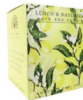
LMC0014 Lemon & Mandarin