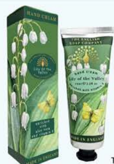
TC0010 Lily Of The Valley