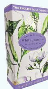
EDT0005 White Jasmine